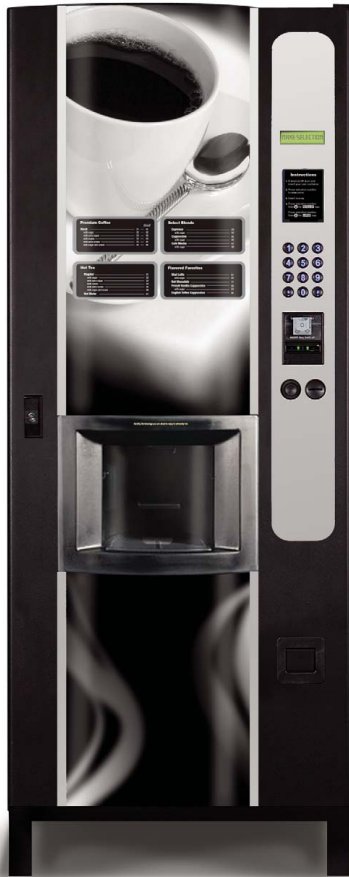
Shown with monochrome styling.